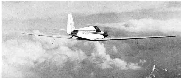
"The experienced soaring pilot can practise cross-country flying.. without having to wait for a really good day!"