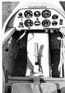
(Below) RF-3 cockpit: the undercarriage retraction lever and locking catch are on the right and air brake lever on the left (forward for closed); valve lifter for airborne engine starting, fuel cock, and carburettor choke are the three control knobs on the right below the panel "Flight" photographs