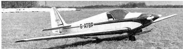
"The unconventional bicycle undercarriage arrangement, with a retractable mainwheel and wire outriggers with tiny plastic wheels attached, works surprisingly well!"

seating position should suit the tallest of pilots (cushions are used to vary the reach). The beautifully smooth canopy is clamped down firmly by an over-centre catch while the fuel tank and the retracted single-wheel undercarriage help to isolate engine noises and vibration. One might expect that, with a low wing-loading, a high aspect ratio and a seemingly stiff wing, the aircraft would be thrown about in turbulence; but in fact it behaved extremely well in a highly unstable 20kt (gusting 35kt) airstream on the day of the test flight.